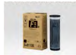
RISO INK FII Type Black (1000 ml)