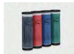
RISO INK FII Type Color (1000 ml)

The RISO iQuality mark indicates a RISO product compatible with the RISO iQuality System.