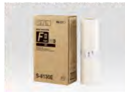
RISO MASTER FII Type (A3: 220 sheets)